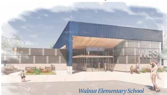
Walnut Elementary School

The 487-day construction began on November 29, 2021 with a projected completion in Spring 2023.